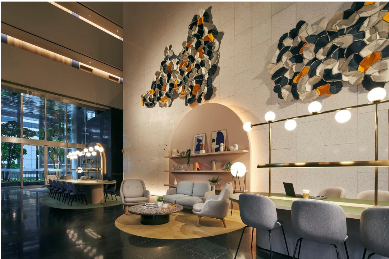
Shared working space at Citadines Raffles Place Singapore

The group's fastest growing brand with over 180 properties to date introduces new signature programmes and celebrates opening of Citadines flagship property in Singapore